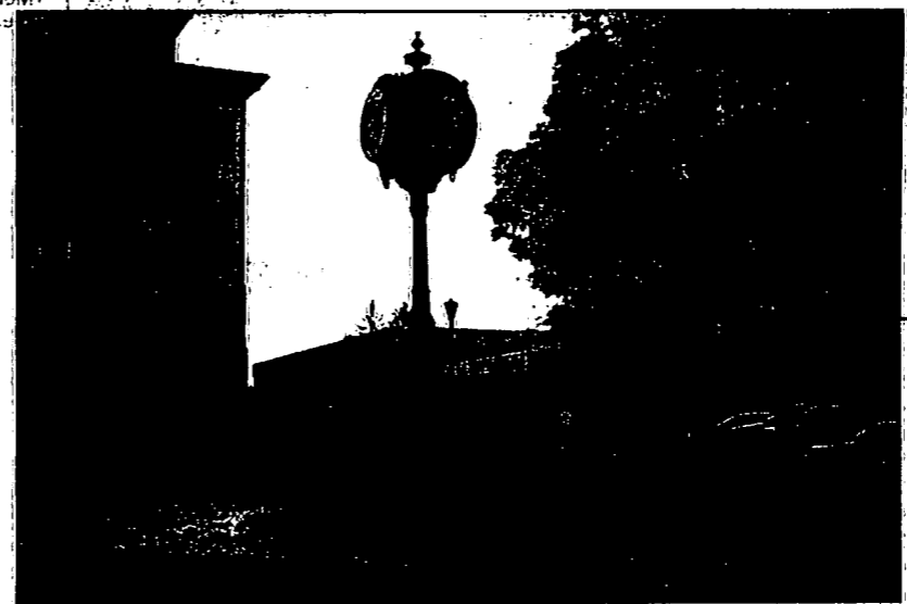
THE CLOCK TOWER

Currently still in construction, Culbertson Hall will serve as an all-freshmen residence hall during the upcoming fall semester.