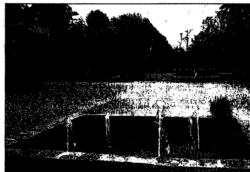
BETTY J. GILLIAM SCULPTURE GARDEN

Located in the courtyard between three academic buildings: the Science Center, Zehmer Hall and Darden Hall.