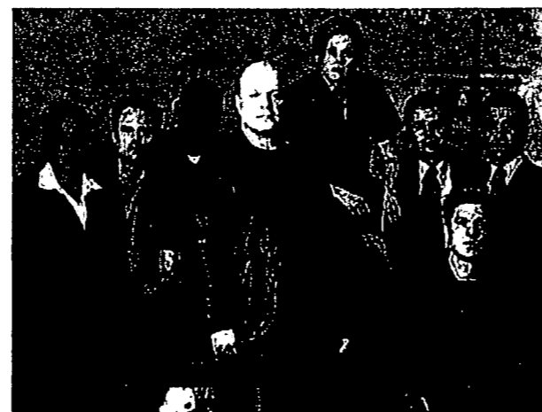
The cast of "The Shield" returns for a third season on FX every Tuesday night.

The Shield airs Tuesday nights at 10 p.m. on FX.