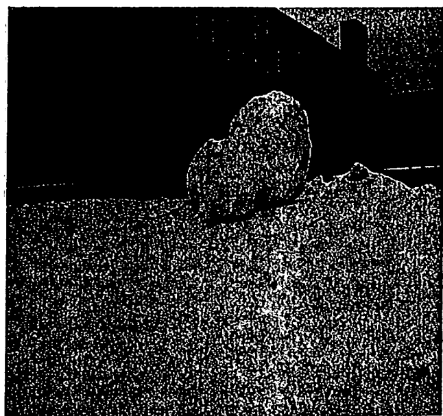
A toppled snowman lies behind Zehmer Hall

The second facility discussed was Crockett Hall. Many of the students know that talk of using Crockett Hall for purposes other than a residence hall has gone on for some time now. Money has been requested to renovate Continued on p.3