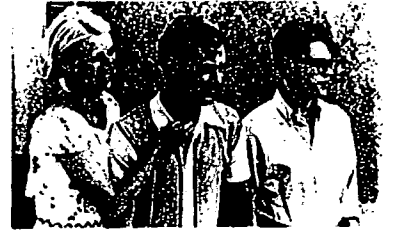
The principal cast of "Ripley."

Marge (Gwyneth Paltrow), and everything seems to be fine. Then Dickie grows tired of Tom. From here on out the story turns into a webwork of lies, forging, and murder that Tom creates in order to keep the little world he has stumbled into. Also among the cast is Philip Seymour Hoffman, who plays a suspicious American friend of Dickie's, and Philip Baker Hall the private investigator.