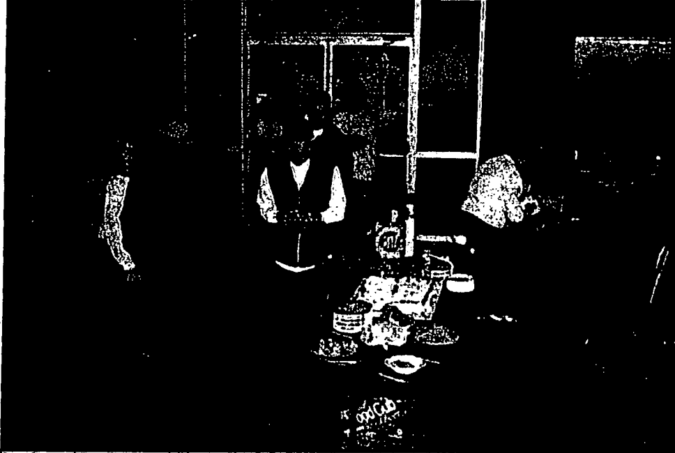
Students filter into Smiddy Hall for the BSU/SAB/WF Super Bowl Bash to watch the game.

On first down in a crucial series, Jevon The Freak Kearse