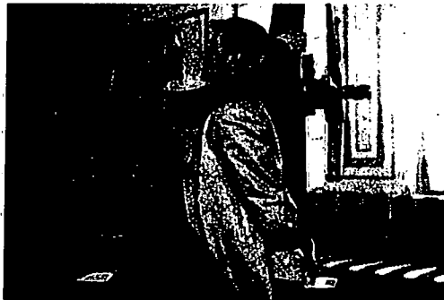
Sophie Marceau gets close to Pierce Brosnan in The World is Not Enough .

(Robert Carlyle), who had already kidnapped her once before. Elektra managed to escape and now fears that Renard is sabotaging the pipelines. Renard is a Bond baddie in typical fashion—a bullet lodged in his brain has