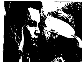
Johnny Depp and Christina Ricci in a scene from the film.

Tim Burton's Sleepy Hollow was released a few weeks ago, and it does not disappoint. What most would think would be a low blood, no graphic violence movie is a shocker. With decapitations, a bloody tree, and senseless violence this movie is not intended for the squeamish. The movie begins easily enough in beautiful New York City around the late 18th century. Inspector Ichabod Crane is called to go to the small town of Sleepy Hollow in upstate New York to investigate a series of