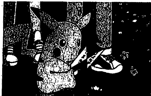
Pikachu is one of the stars of the Pokemon craze.

This movie grossed a record $10 million on its first day, more than doubling the previous Wednesday record of $4.8 million by "Toy Story". In the movie, pokemon monsters are trained and pitted against each other in battle. The movie is basically like three of the cartoon episodes in one. In the opening short, a Pokemon named Pikachu is introduced. Pikachu and its keeper Ash Ketchum are the heroes of the film. Pikachu and Ash get invited to an exclusive trainer party on an island. Little do they know that the cloned, genetically engineered super Pokemon Mewtwo is present on the island (wa. Oh, did I mention that Mewtwo is also psychic. Anyway, Mewtwo goes postal and