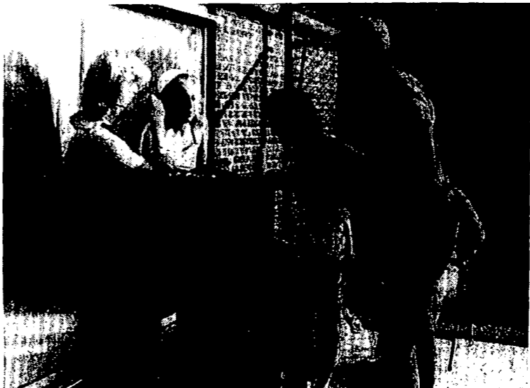
Students gather at a pool party.

The CVC Film Series is an activity supported by the SGA and administered by the Film/Lecture Committee, to provide entertaining, thought-provoking and interesting films, on a regular basis, to the CVC milieu. A poster, with film selections, descriptions, time and dates, is available all around campus—get one and post it, it will be your key to enjoyment from Zappa to Garbo, Nureyev to Truffault. We have recent block busters, international films, silent and classics, documentaries, science fiction, and rock 'n roll films. Hopefully, there is something for everyone. So, come join us at the movies every Wednesday and Sunday, 7:00 p.m. and 9:15 p.m., in the Science Lecture Hall. You have my warmest welcome to CVC and my wish that you have a happy and productive fall semester.