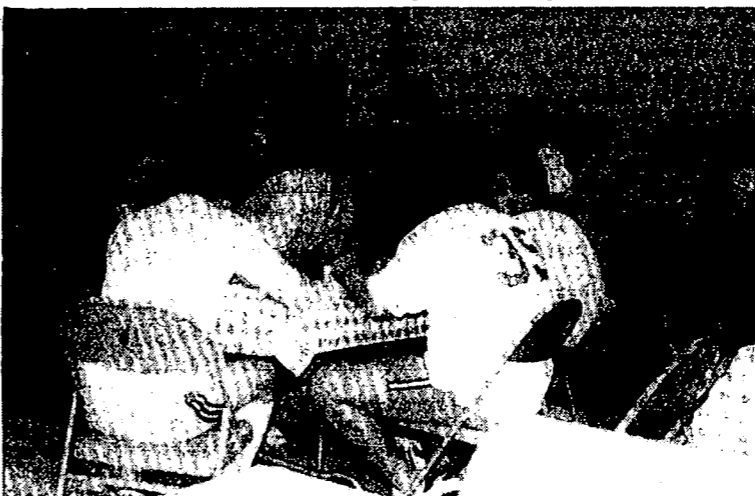
Dinner at the United Student Center.