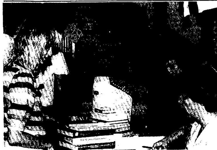
REGISTRATION AND ORIENTATION...