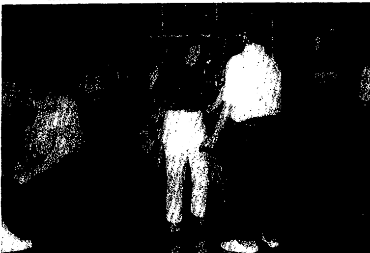
SGA WELCOME-BACK DANCE