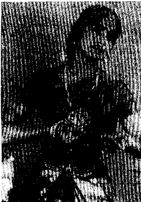
PLEASE SUPPORT OUR ONE-PITCH TOURNEY

All in all, the team looks to be stronger this year with the returning players and the new talent, hopefully laying the grounds for a good season to come. With lots of hard work, and perhaps a little luck, CVC could improve on last year's 9-7 record and push defending champ Thomas Moore to defend their title.