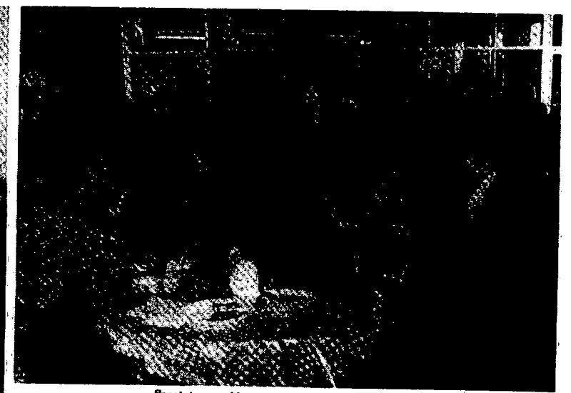
Spectators could try the foods of various countries.