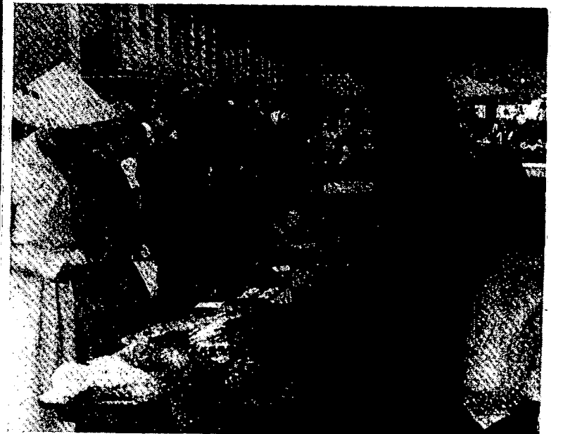
Many International displays and souvenirs were available for onlookers.