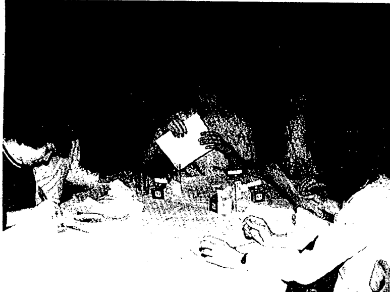
Shows are a few of the 1982-83 Sole at the breakfast held for them last week.

13, we will be sponsoring a dance and in the near future a spaghetti dinner will be held. Hope to see you there!