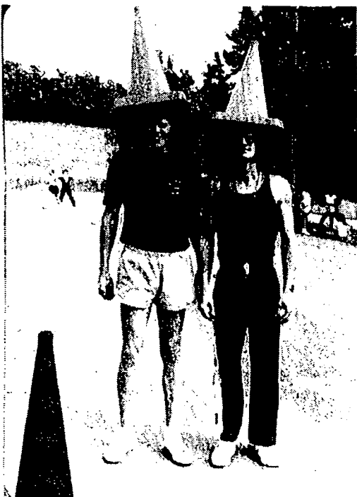
Take me to your leader.