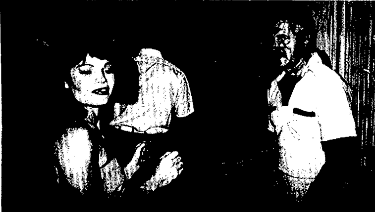
I hope no one will tell! by Elaine Womble