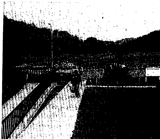
Loads and loads as students begin moving in.