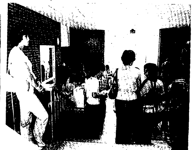
Finally, registration arrives with lines, lines, and more lines.