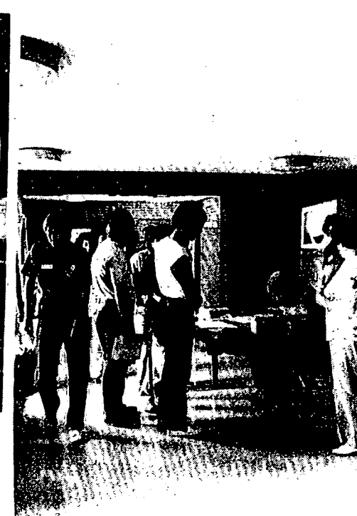
Freshmen begin arriving to move in their rooms.