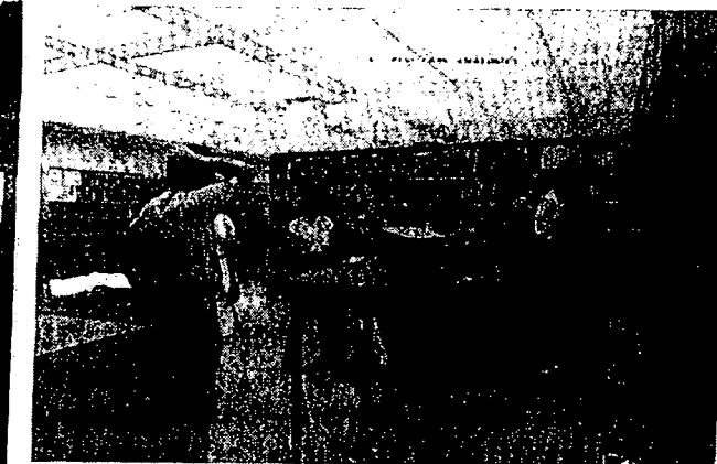
The campus tour takes a stop at the library to orientate the "new-comers".