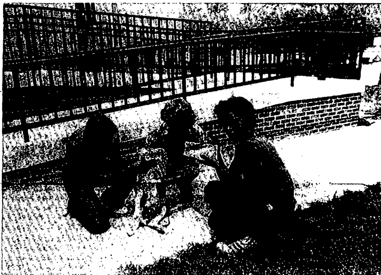
Welcome back from Summer! CVC students catching up after a fun-filled Summer break.