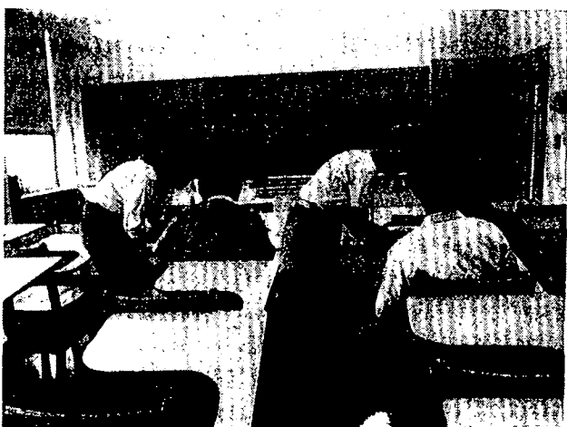
Faculty advisors and SOLS aided the freshmen in completing their fall schedule.