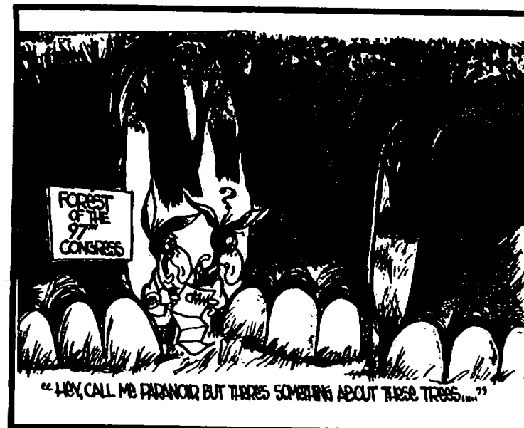
"HEY, CALL ME PARANOID BUT THERE'S SOMETHING ABOUT THESE TREES..."