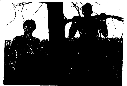
Students and Faculty enjoying the weather