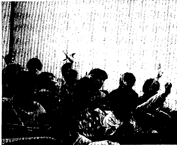
The SGA allocates money to find a band for the Spring Formal.