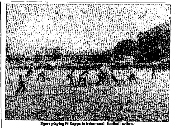
Tigers playing Phi Kappis in intramural football action.