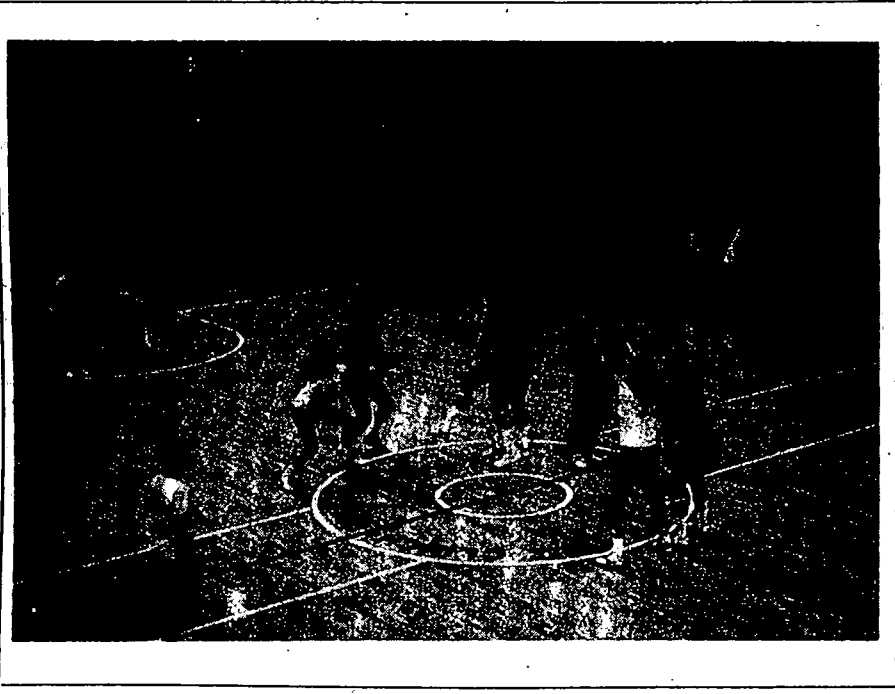
Sharon Morris jumps high as CVC Women try to control a jump ball.