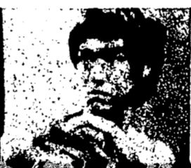
was truly a "force of one." Rated R.