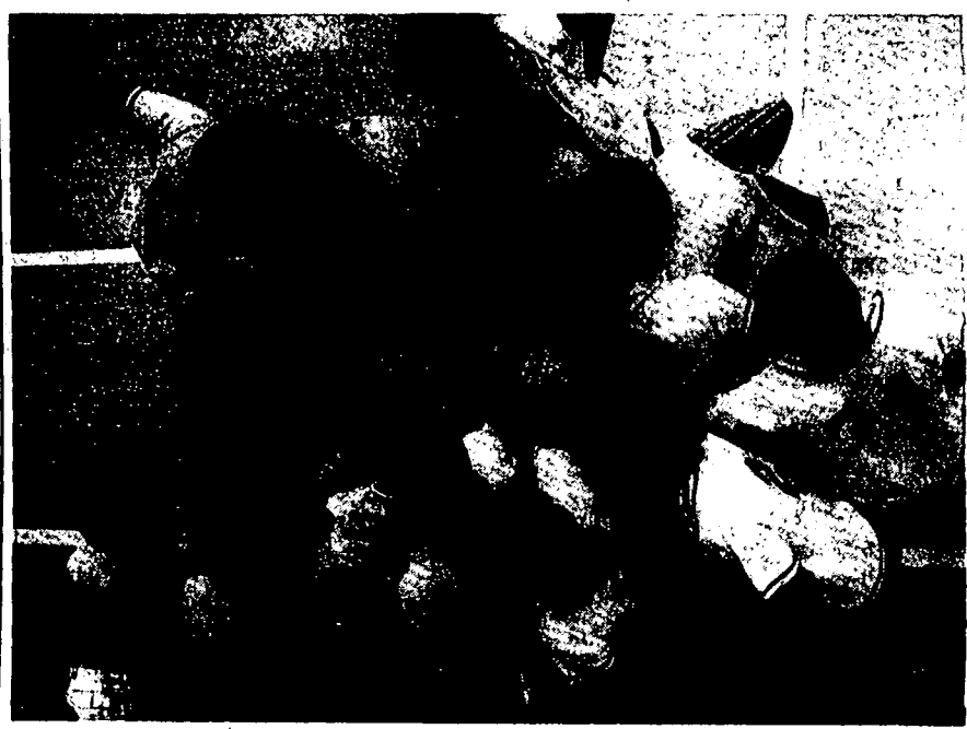
"Team's In A Huddle" as CVC Women host Randolph Macon on Sat. Jan. 26