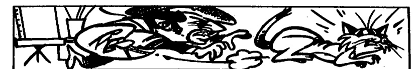
Legend has it that the great, early American artist Benjamin West made his first paint brushes out of hairs plucked from the tail of the family cat.