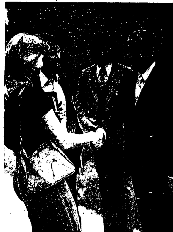
Elmo Zumwalt, democratic candidate for the Virginia Senate visited the CVC Campus on Wednesday, September 15.