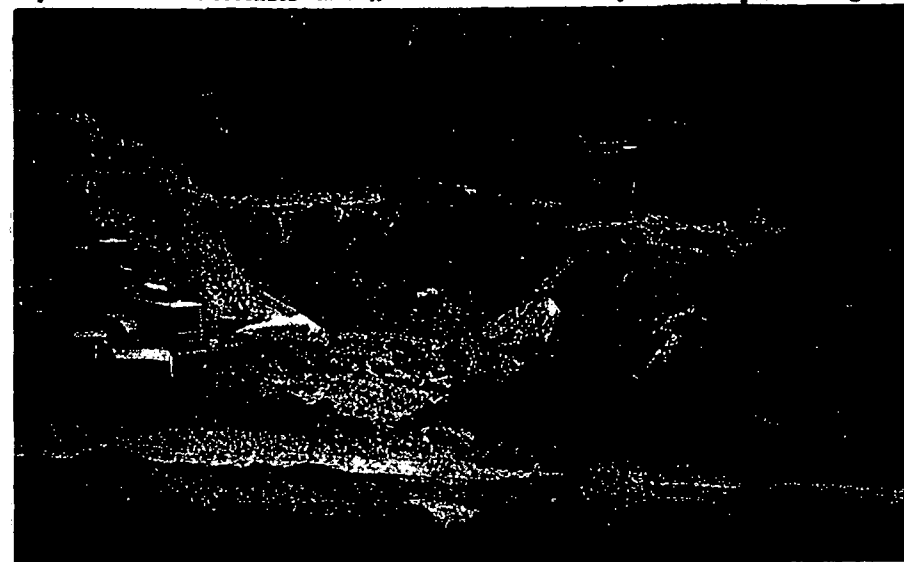
Horne Brothers Coal Company strips college land. Funds to be used for Student Union Building.

College officials expressed hope this week that revenues from the strip and auger college's northwestern campus mining of 10 acres of the pus area will provide a significant portion of the funds needed to permit the construction of a new student union facility.