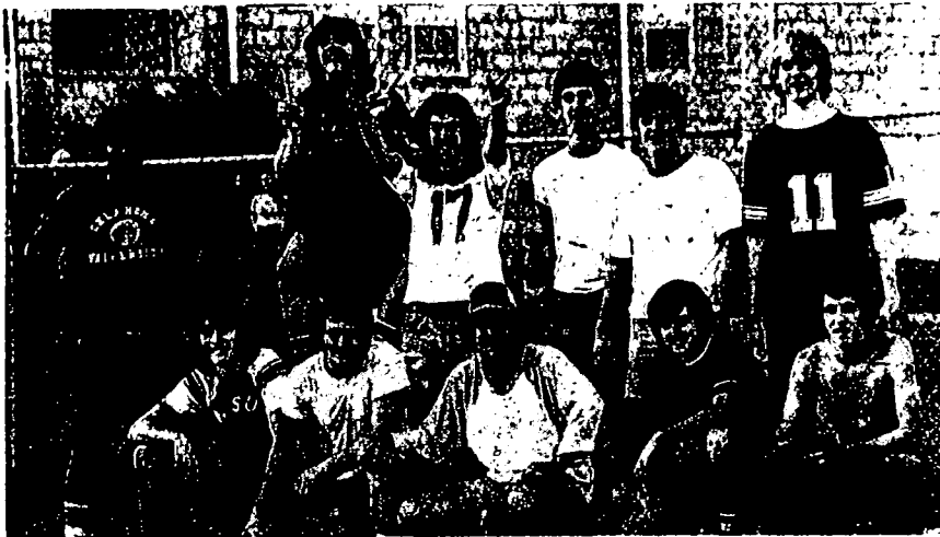
The Winners- Intramural Softball