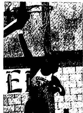
Fred Gese top notch rebounder.